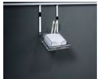
Stationary set holder > W x D x H 145 x 150 x 271 mm