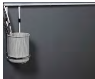
Quiver holder > W x D x H 147 x 150 x 336 mm