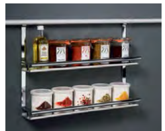
Spice tray > W x D x H 380 x 80 x 271 mm