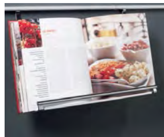
Cook book holder > W x D x H 440 x 74 x 321 mm