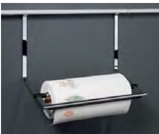
Paper towel holder > W x D x H 325 x 150 x 260 mm