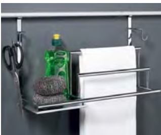
Dish washing paraphernalia > W x D x H 505 x 150 x 271 mm