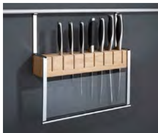
Knife holder > W x D x H 380 x 80 x 370 mm