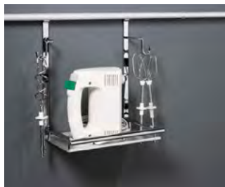
Mixer holder > W x D x H 295 x 150 x 271 mm