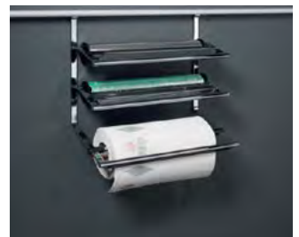
Profile roll holder > W x D x H 352 x 150 x 305 mm

A product in its emphasis on form and function, manufacturing quality and fine design. This versatile system lets users personalise their choice of elements and add to them as required. The functional elements are simply hung onto the rail. It's easy to move them just where you want them. One highlight is the 3-level roll holder. A patented device lets users tear off cling film smoothly. This is just one example of a wealth of practical, patented inventions.