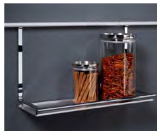
Universal tray > W x D x H 440 x 150 x 271 mm