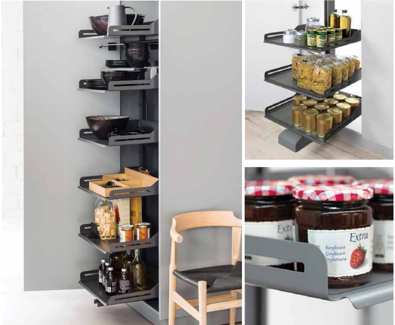
The premium larder pull-out for kitchens, living rooms and offices